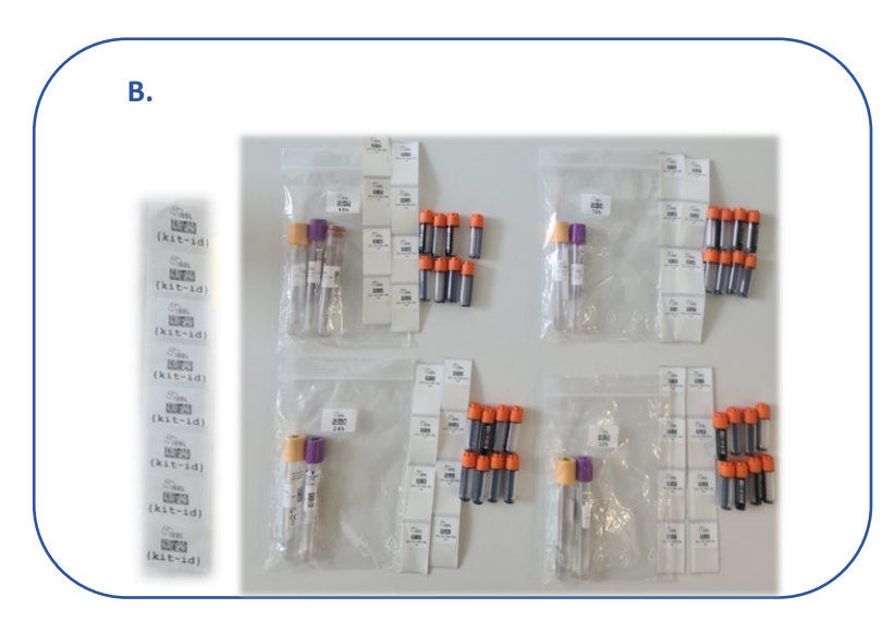
Figure 1 A. A sample collection kit for one patient. B. The content of a sample collection kit, including a strip of kit ID labels and 4 smaller bags for the timepoints 12, 24, 48, 72 h with blood collection tubes and materials for the laboratory (cryovials and labels for cryovials).